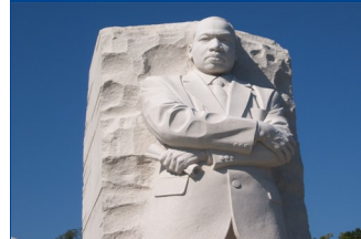
Martin Luther King, Jr. National Memorial