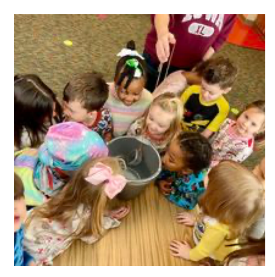
Call to register your child today!

Classes begin on Tuesday, September 3, 2024